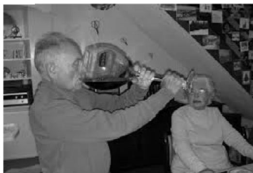
Prince Philip taking his morning constitutional glass of Retsina .