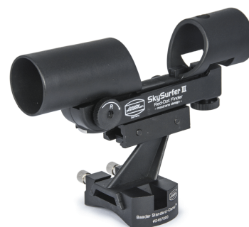
SkySurfer III (#2957300) - shown with optional Baader Standard-Base (#2457000)