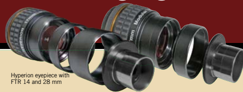
Hyperion eyepiece with FTR 14 and 28 mm

Hyperion eyepiece with FTR 14mm (this combination is also portrayed in the picture below which features the 2" mirror star diagonal)