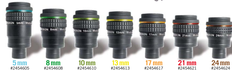
5 mm #2454605

The whole family of Hyperion 68° eyepieces: