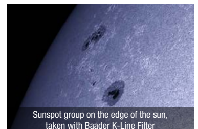
Sunspot group on the edge of the sun, taken with Baader K-Line Filter

You can find an animation on our website which shows the difference between white-light (continuum, 550nm) and Calcium-K (395nm). There are also illustrations and explanations regarding Ellerman bombs and Supergranulation:: www.astrosolar.com/animation-cak-cont