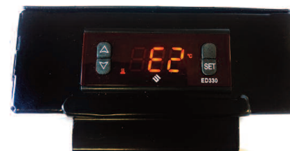
The Irwin waterbath head unit showing the maximum temperature limit setting.

The hidden menu may be accessed by pressing and holding the SET button down for 10 seconds. The LED display will show E1. Briefly press SET and toggle through the menu options using the up/down keys to change settings. Once you have made changes, leave the unit for about 6 seconds to exit to the menu to resume normal operation.