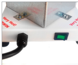
13 Amp plug power supply with on/off switch at rear.