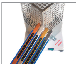
Safety casing prevents direct heat contact.