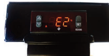
The Irwin waterbath head unit showing the maximum temperature limit setting.

The hidden menu may be accessed by pressing and holding the SET button down for 10 seconds. The LED display will show E1. Briefly press SET and toggle through the menu options using the up/down keys to change settings. Once you have made changes, leave the unit for about 6 seconds to exit to the menu to resume normal operation.