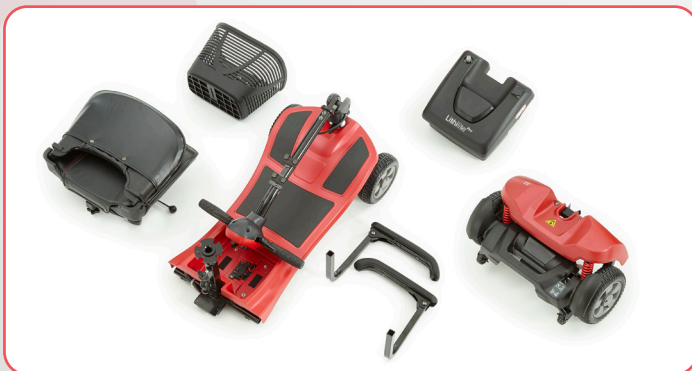
Come To Bits Easily

The Lithilite range adds innovative Lithium battery technology to a high quality, tried and tested design.