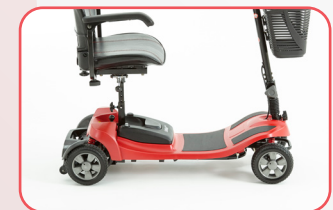
High Ground Clearance