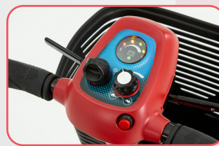
Soft Grip & Dual Controls