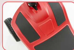
Long Flat Pan For Leg Room