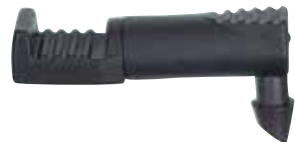
Midi Drip™ Barb 4 mm