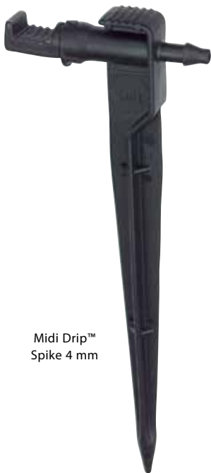
Midi Drip™ Spike 4 mm