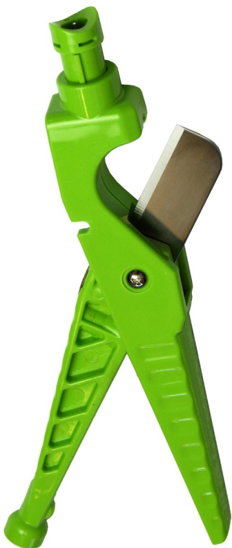
Punch 'N' Cut

Warning: Punch pin is sharp, blade is sharp. Keep away from children