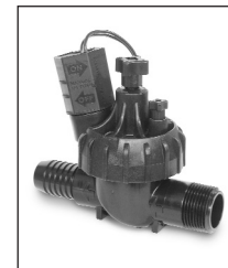
Male x Barb