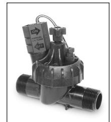
Male x Male