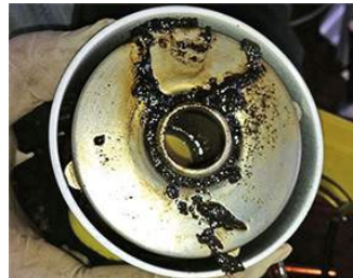
A filter clogged up with nasty diesel sludge