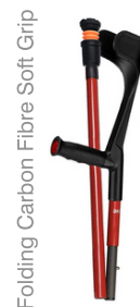
Folding Carbon Fibre Soft Grip