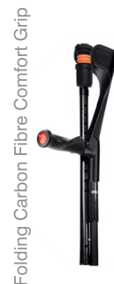
Folding Carbon Fibre Comfort Grip