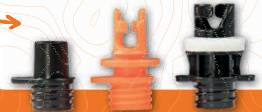
Universal & Vango Airbeam® Adaptors

Also comes with: Charging Cable & Instruction manual